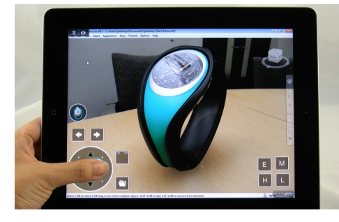
Use customized controls for 3D CAD/CAM on iPad